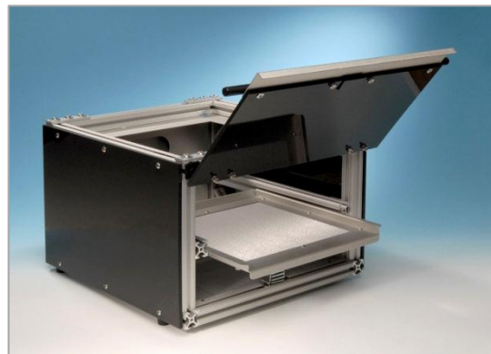
Dymax Light Shield