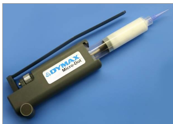
Lever Activated Micro-Dot Syringe Dispenser (T20010)