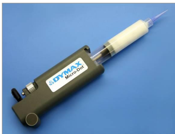
Thumb Activated Micro-Dot Syringe Dispenser (T20000)

The Micro-Dot™ portable syringe dispenser offers positive-displacement accuracy for dispense volumes as small as 0.0003 mL. Once a volume is set it can be repeated with accuracy. This syringe dispenser utilizes a pre-packaged disposable syringe as its fluid reservoir, preventing any contact between the fluids and the dispenser eliminating fluid contamination during dispense. With the proper dispense tip selection, the Micro-Dot is suitable for dispensing a wide range of low-to-high viscosity fluids including pastes, lubricants, adhesives, sealants, and more.