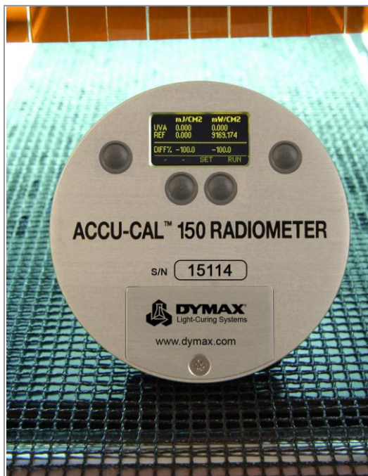
ACCU-CAL 150 for measuring UV light emitted from UV light-curing flood lamps and conveyor systems only (PN 40550)

Simple to Operate ■ PTB and NIST Traceable ■ CE Marked