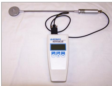
Figure 3. Radiometer with Detector