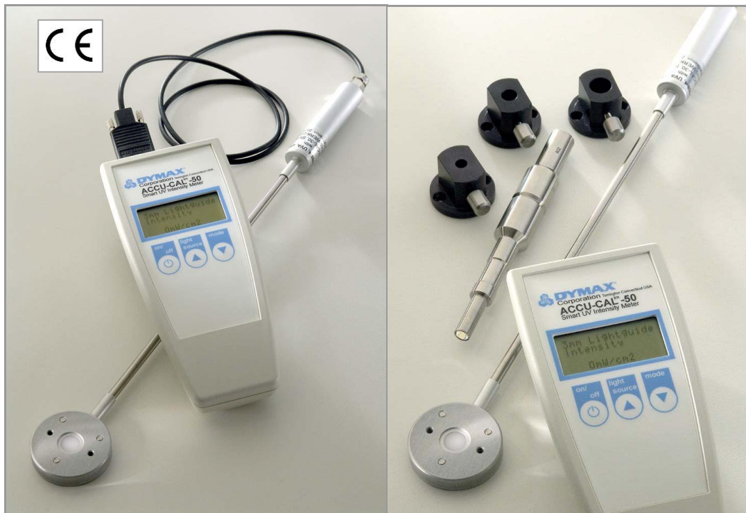
ACCU-CAL™ 50 for Flood Lamps (PN 39561)