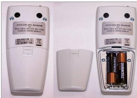
Figure 8. Battery Compartment (Closed & Open)