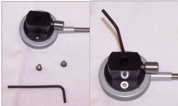
Figure 5. Adapter Installation