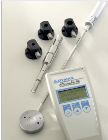
Figure 2. Flood Radiometer (PN39561)