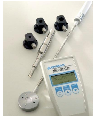
Figure 2. Hand-Held Radiometer