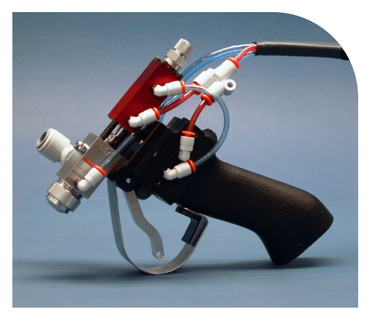
Model 210 Spray Valve with Gun Accessory

The Model 210 valve can be fitted with numerous accessories to customize the valve for the user's application. Compatible with numerous styles of material reservoirs, this spray valve can dispense materials from a variety of different packages. The standard model is fitted with a round spray cap that provides a circular spray pattern, but an optional flat spray cap is available if a linear or flat spray pattern is preferred. A pneumatic trigger gun assembly is also available for this valve, allowing users to have manual control over the valve and its spray.