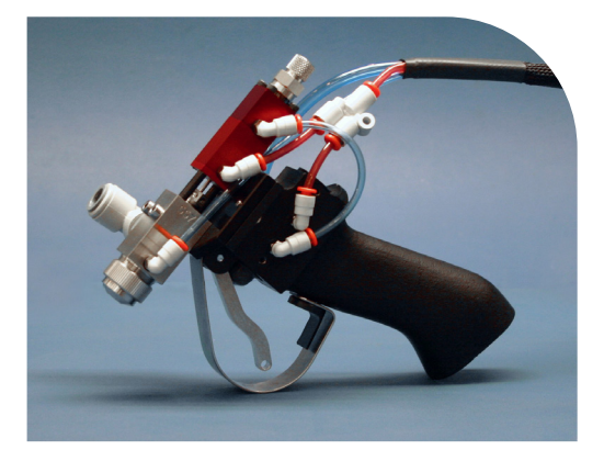
Model 110 Spray Valve with Gun Accessory

The spray valve can be fitted with numerous accessories to customize the valve for the user's application. Compatible with numerous styles of material reservoirs, this spray valve can dispense materials from a variety of different packages. The standard model is fitted with a round spray cap that provides a circular spray pattern, but an optional flat spray cap is available if a linear or flat spray pattern is preferred. A pneumatic trigger gun assembly is also available for this valve, allowing users to have manual control over the valve and its spray.