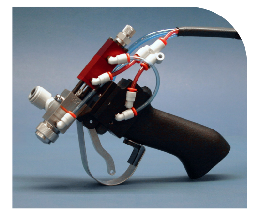
Model 110 Spray Valve with Gun Accessory

The spray valve can be fitted with numerous accessories to customize the valve for the user's application. Compatible with numerous styles of material reservoirs, this spray valve can dispense materials from a variety of different packages. The standard model is fitted with a round spray cap that provides a circular spray pattern, but an optional flat spray cap is available if a linear or flat spray pattern is preferred. A pneumatic trigger gun assembly is also available for this valve, allowing users to have manual control over the valve and its spray.