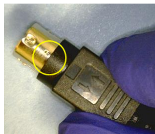
Retracted position for insertion and removal