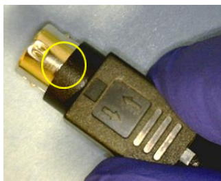
Position of plastic when housing is not retracted

A: The plug assembly is oriented by locating the flat surface of the housing toward the top. Also identified are arrows that indicate that when inserting the connector into its receptacle, the sleeve should be retracted. This will allow easy insertion. Removal of plug from receptacle is easily accomplished by a retraction of the housing in a direction away from the connector.