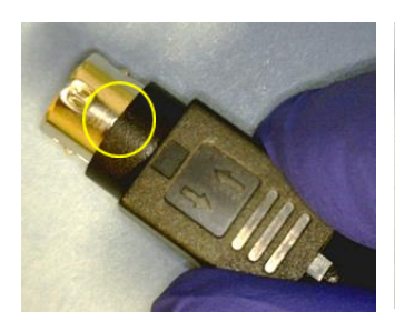
Position of plastic when housing is not retracted

A: The plug assembly is oriented by locating the flat surface of the housing toward the top. Also identified are arrows that indicate that when inserting the connector into its receptacle, the sleeve should be retracted. This will allow easy insertion. Removal of plug from receptacle is easily accomplished by a retraction of the housing in a direction away from the connector.