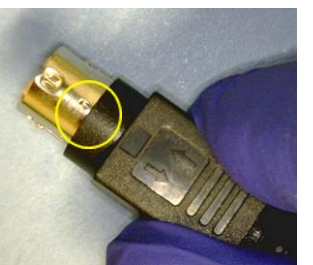
Retracted position for insertion and removal