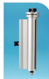
12 oz (300 mL) T14085