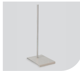
24 in [60.96 cm] Lab Stand