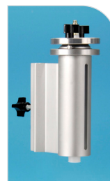
6 oz (160 mL) T15257