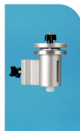
2.5 oz (74 mL) T15254

Standard cartridge drop-in reservoir packages include a cartridge retainer, retainer cap, adjustment knobs, and a quick disconnect.