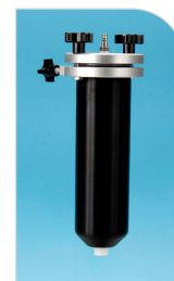
20 oz (550 mL) T15223