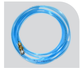
Reservoir Air-Line Kit