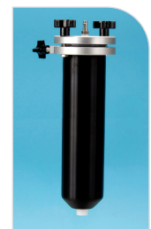
32 oz (900 mL) T15224