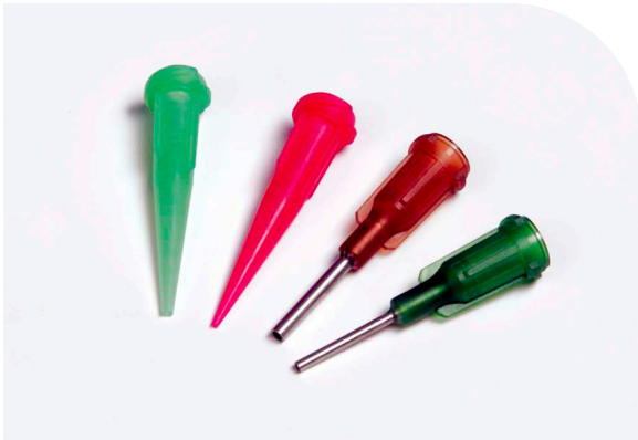
Figure 2. Taper and Needle Dispensing Tips

The most common dispense tips used with light-curable adhesives are needle and tapered tips. Both are available in various lengths, gauges, and shapes. To ensure precise application, the length, shape, and size of the tip will define the shape of the fluid deposit and the dispense performance. Smooth flow tapered tips provide less resistance to flow, shear, and backpressure. These are preferred in most cases. Needle tips allow for access into tight clearances and injection ports; however, they produce more shear force on the adhesive and increase resistance to flow. The backpressure created by this restriction can cause pressure buildup in the reservoir which results in dripping and drooling out of the tip as the pressure continues to escape. Needle tips are typically more compatible with lower viscosity fluids. Using the shortest tips and largest gauges acceptable for the application are recommended in order to reduce unnecessary flow resistance.