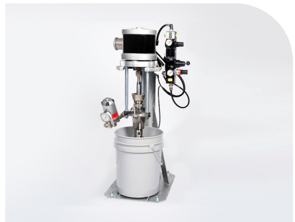
Figure 3. Ram Pump System

If the same type of thixotropic fluid were to be dispensed through a pressure pot, higher pressures would be needed to push the material down. This excess pressure can push air bubbles into the adhesive, or even past the adhesive, which would result in air reaching the valve. It can also cause cavitation, a condition where the adhesive is pushed to the sides of the pressure pot creating a cavity in the center.