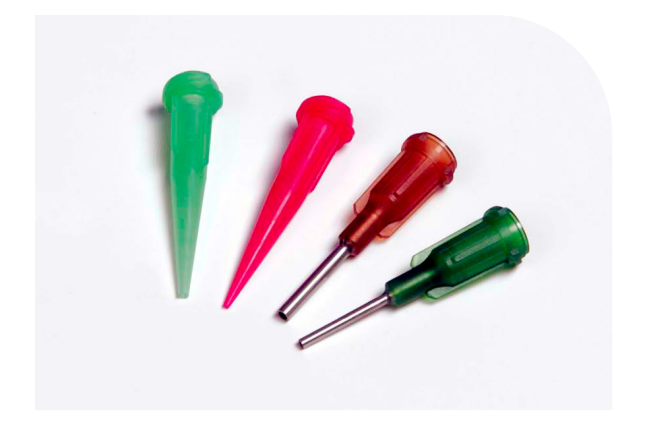
Figure 2. Taper and Needle Dispensing Tips

The most common dispense tips used with lightcurable adhesives are needle and tapered tips. Both are available in various lengths, guages, and shapes. To ensure precise application, the length, shape, and size of the tip will define the shape of the fluid deposit and the dispense performance. Smooth flow tapered tips provide less resistance to flow, shear, and backpressure. These are preferred in most cases. Needle tips allow for access into tight clearances and injection ports; however, they produce more shear force on the adhesive and increase resistance to flow. The backpressure created by this restriction can cause pressure buildup in the reservoir which results in dripping and drooling out of the tip as the pressure continues to escape. Needle tips are typically more compatible with lower viscosity fluids. Using the shortest tips and largest gauges acceptable for the application are recommended in order to reduce unnecessary flow resistance.