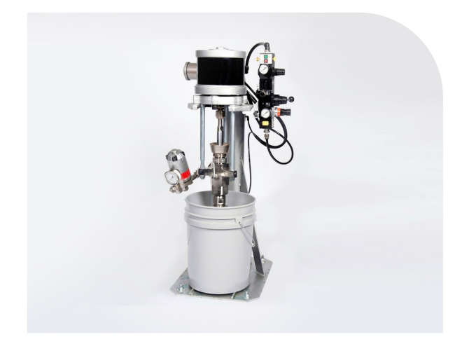
Figure 3. Ram Pump System

If the same type of thixotropic fluid were to be dispensed through a pressure pot, higher pressures would be needed to push the material down. This excess pressure can push air bubbles into the adhesive, or even past the adhesive, which would result in air reaching the valve. It can also cause cavitation, a condition where the adhesive is pushed to the sides of the pressure pot creating a cavity in the center.