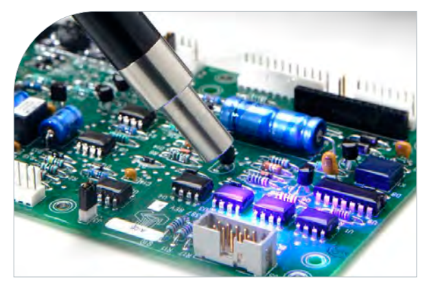
Spot Lamps for Rework or Curing Small Areas

Given the value of electronic components in modern cars, their relative fragility, and the harsh environment in which they are placed, as well as the increasing need to save space, conformal coatings are an ideal solution to the problem of optimized protection. Light-cure conformal coatings can be used to save time and space and to increase efficiency while effectively protecting PCBs in the automotive industry.