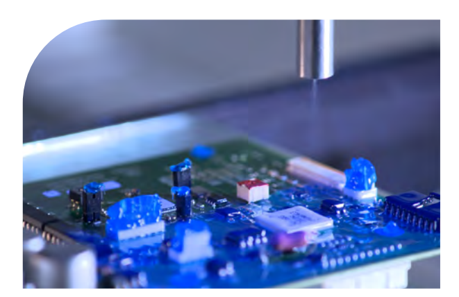
Conformal Coating Sprayed on PCB

Brushing can also be done manually, and it is used more for touch-up work or small areas. Reliability and repeatability do depend highly on the operators.