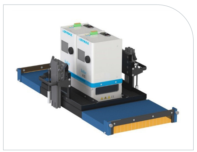
Two Emitters, Mounted Front-to-Back, 5" Wide Double Exposure