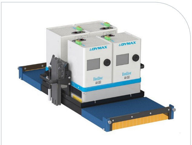
Four Emitters, 10" Wide Double Exposure