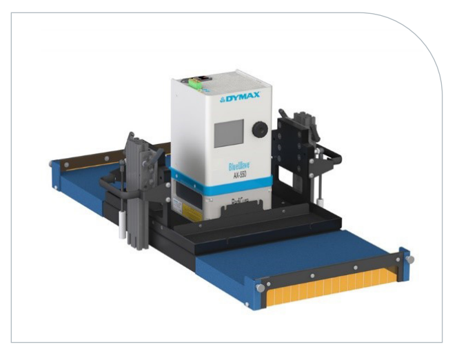
One Emitter, Center-Mounted, 5" Wide Single Exposure

UVCS-series conveyors can be outfitted with one, two, or four BlueWave® AX-550 LED flood emitters. If two emitters are used, they can be either center mounted (CM) or mounted full width (FW) as shown in the diagrams below. BlueWave® AX-550 LED flood emitters provide high-intensity curing energy over a 5" x 5" (12.7 cm x 12.7 cm) curing area. 365 nm, 385 nm, and 405 nm wavelength configurations are available. The selection of the correct wavelength emitter will depend on the material being used and other application requirements. Contact Dymax Application Engineering for more information on optimizing your adhesive and curing equipment.