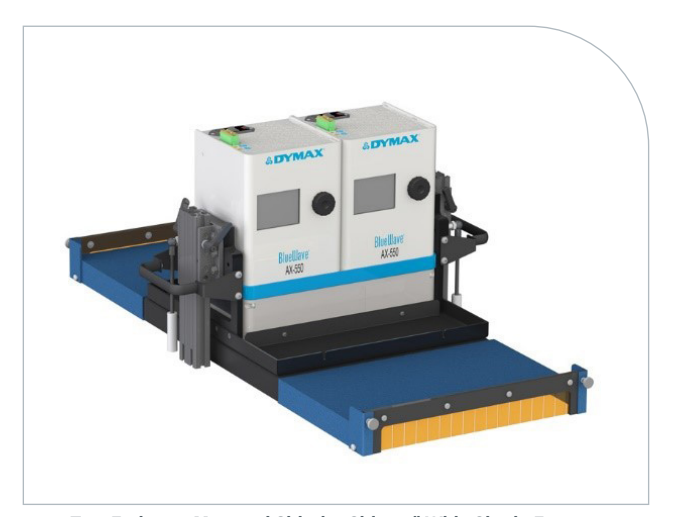
Two Emitters, Mounted Side-by-Side, 10" Wide Single Exposure