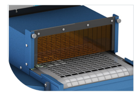
12" Relt Width