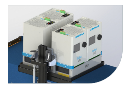
Compatible with up to Four Emitters