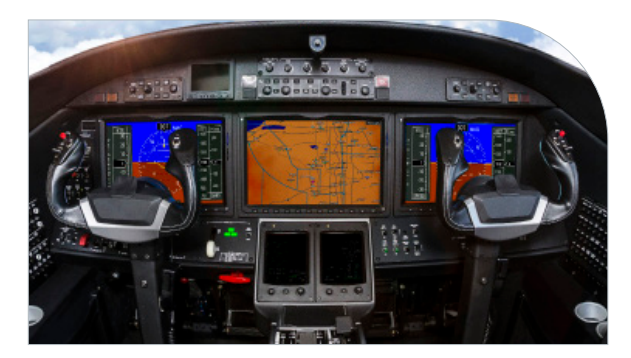
Optical bonding increases clarity, viewing angle, and vibration resistance

The "on-demand cure" of these adhesives allows substrates to be repositioned precisely until parts are ready to be cured. Using a thin layer of Dymax adhesive controls cost and can reduce the weight of the final product. The adhesive also acts as a barrier against stress, significantly improving product reliability and warranty costs. Dymax display adhesives come in a variety of viscosities for ease of use and controlled dispensing and are available in a wide range of packaging sizes.