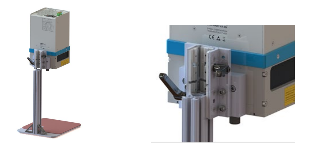
Figure 3. Slide Carriage into Stand