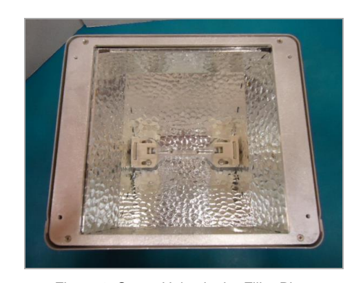
Figure 2. Screw Holes in the Filler Plate