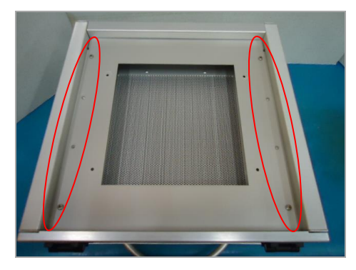
Figure 3. Light Shield Top Cover, M4 x 8 mm Screws