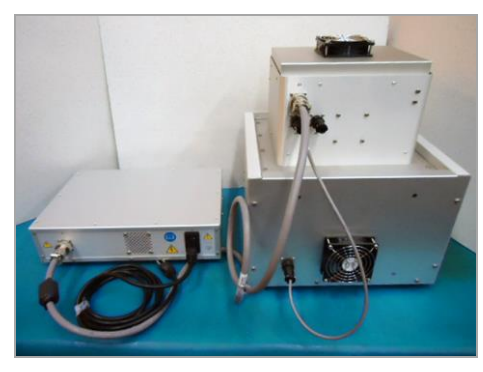
Figure 6. Rear Connections