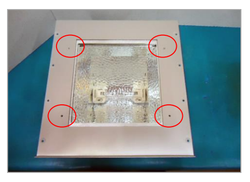
Figure 4. Flood Lamp/Top Cover Assembly

WARNING! With the lamp installed directly to the light shield assembly, the lamp is continuously on when power is applied to the unit. Take appropriate safety precautions when using the equipment in this configuration.