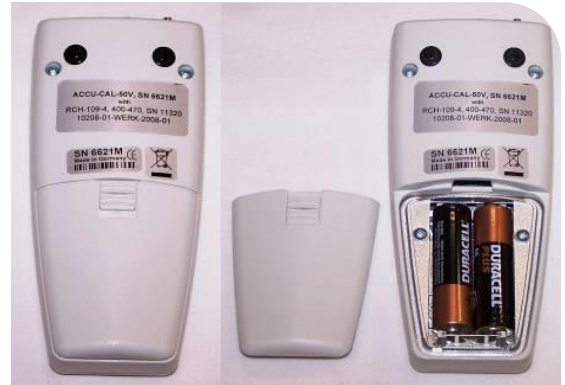
Figure 7. Battery Compartment (Closed & Open)