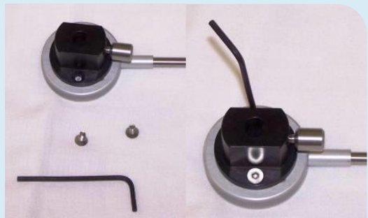
Figure 5. Attach Lightguide Adapter to Lightguide (Step 4)