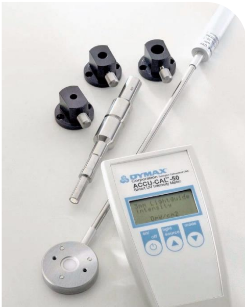
Figure 1. Spot Radiometer (PN39560)