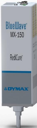
Figure 1. BlueWave MX-150 Emitter