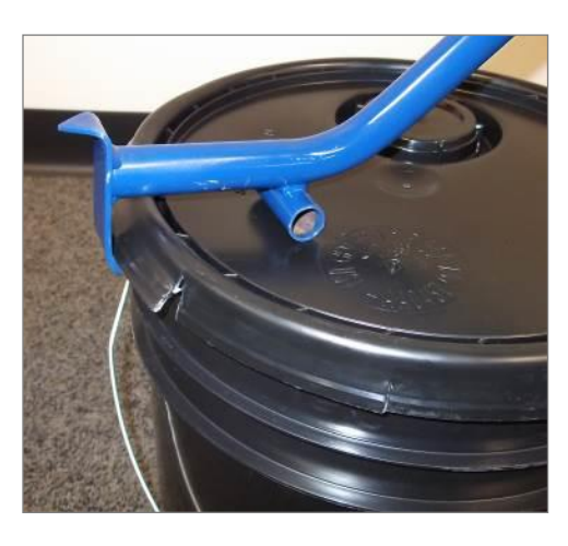
Figure 3. Repeat Step 2 Around the Entire Circumference of The Pail