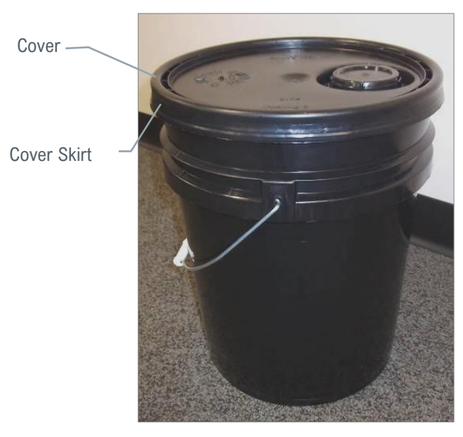
Figure 1. Pail Components