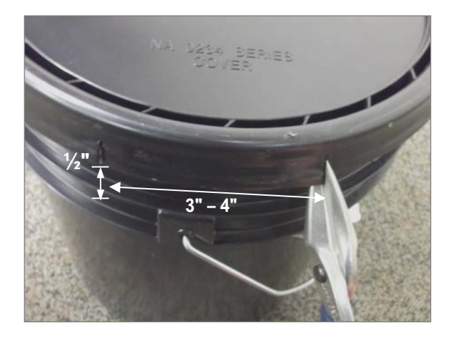
Figure 2. Place the Cutting Tool Under the Cover Skirt and Cut \frac{1}{2} " Slits from the Bottom Up, 3"-4" Apart