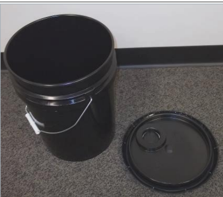
Figure 5. Lift Cover Up and Open Pail