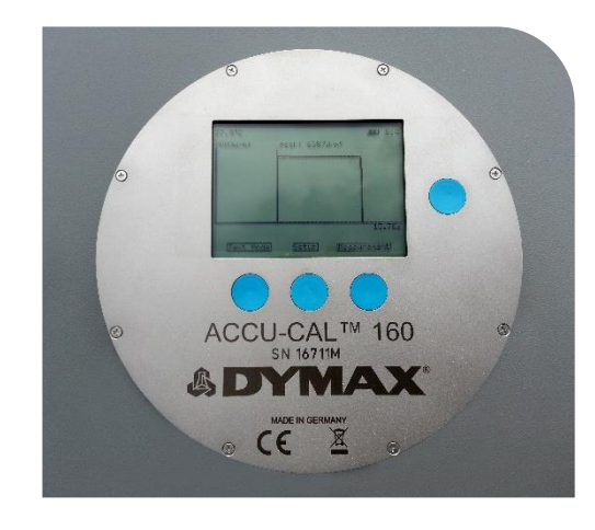
Figure 1. Puck-Style Radiometer