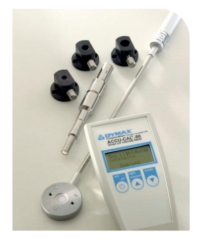
Figure 2. Hand-Held Radiometer