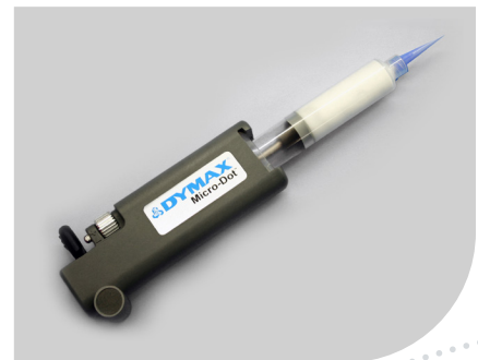
Thumb Activated Micro-Dot Syringe Dispenser (T20000)