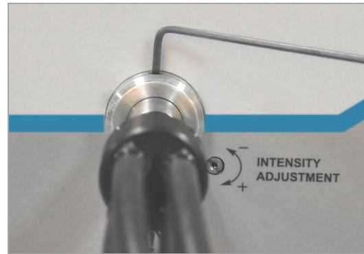
Figure 2. Gently Tighten Setscrew on Lightguide Mount with Hex Wrench