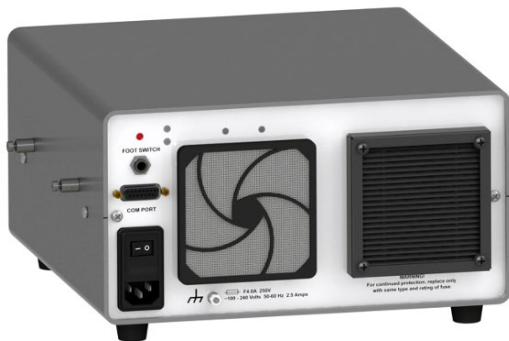
Figure 3. Rear Connections