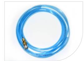
Reservoir Air Line Kit