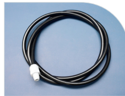
PE Fluid Line Kit