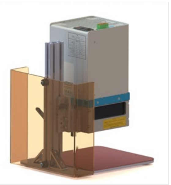
Figure 4. Slide Back Panel into Position