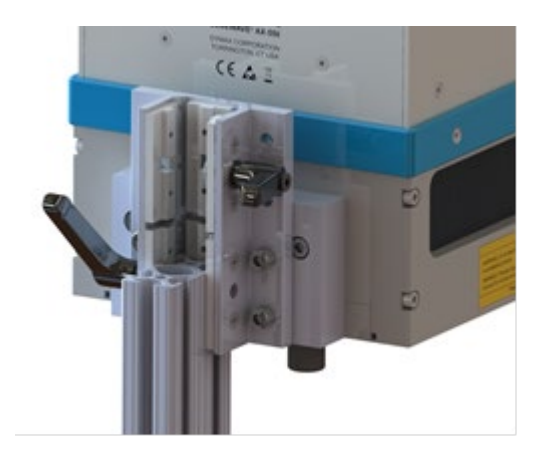
Figure 3. Slide Carriage into Stand