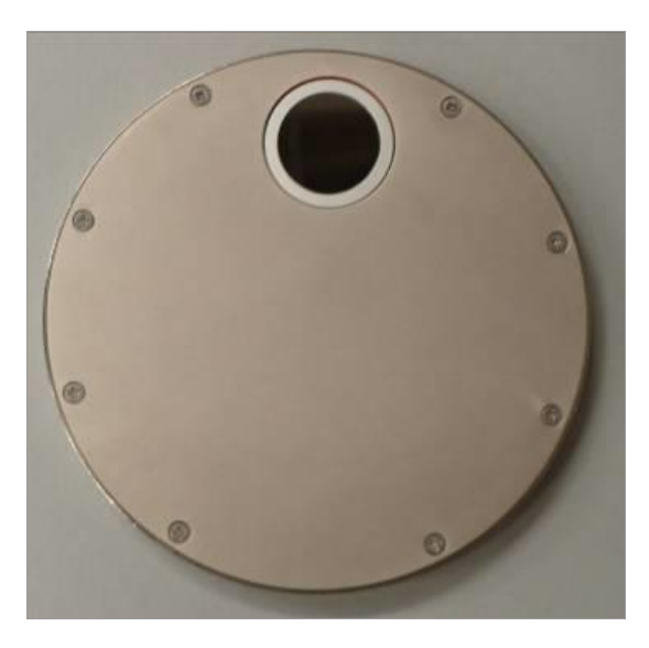
Figure 3. Optics Window (Located on the Backside of the Radiometer)

5. Exiting RUN mode: A short press of the STOP button (Soft Button display bar indicates STOP next to the ON/OFF Button) will exit RUN mode and will return to the same default mode prior to making the exposure run, but will show the new value.