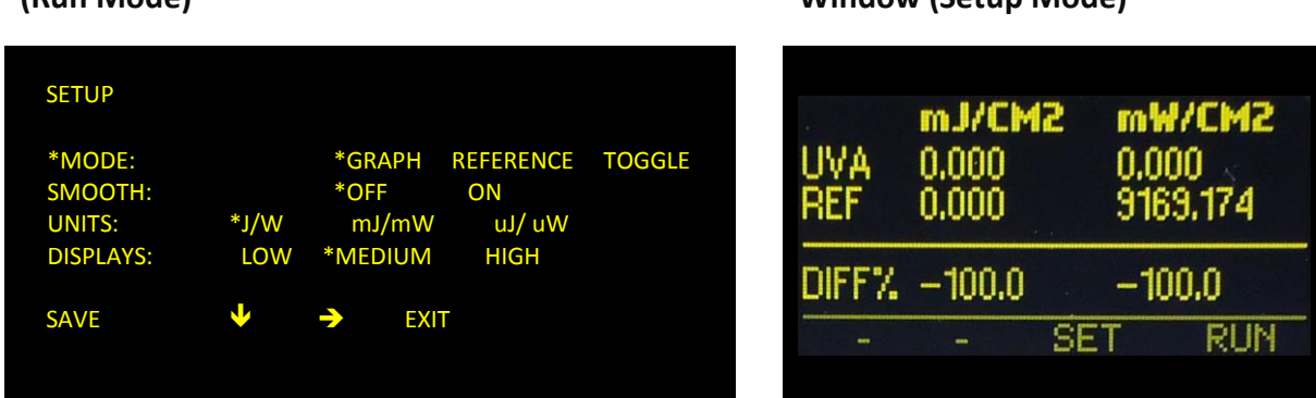
Figure 4. ACCU-CAL<sup>™</sup> 150 Display Window (Run Mode)

To enter SETUP mode, press and hold the SETUP Mode Button located to the left of the Display Window for 0.5 second, then release. The Display Window will show the current settings. Default modes will appear with an asterisk (*) before them. The Display Window below shows all possible choices for setup of each mode.