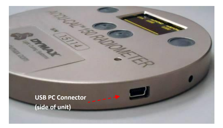
Figure 7. USB PC Connector

The Radiometer must be connected and turned on before transferring data.