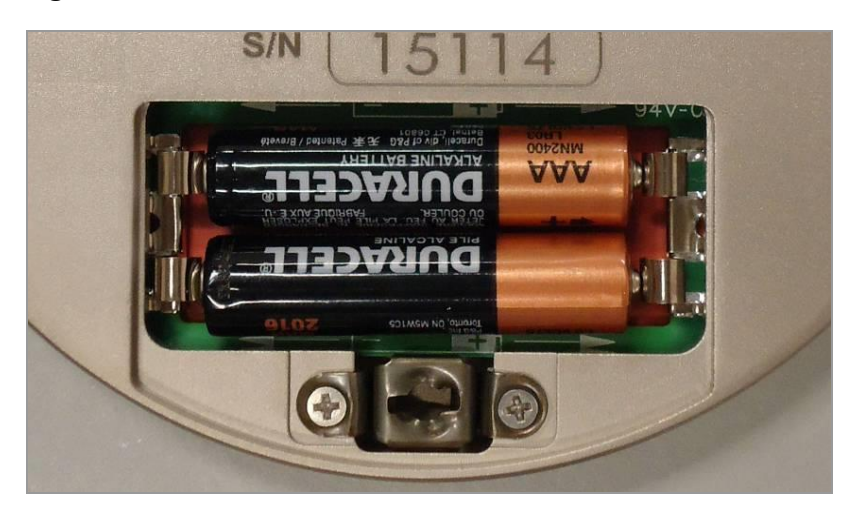
Figure 6. Direction of Batteries