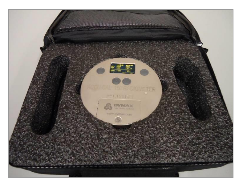
Figure 1. ACCU-CAL<sup>™</sup> 150 Radiometer (PN 40550) (shown in carrying case (included))

Check that the parts included in your order match those listed below. If parts are missing, contact your local Dymax representative or Dymax Customer Support to resolve the problem.