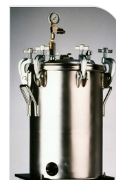
Pail Drop-In Reservoir