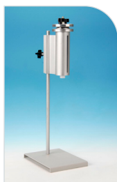
6 oz (160 mL)