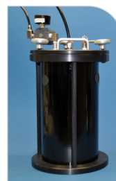
Bottle Drop-In Reservoir