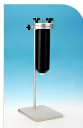
20 oz (550 mL)