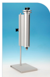
12 oz (300 mL)