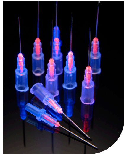
Under low-intensity UV light, Ultra-Red materials fluoresce bright red, enabling easy bond-line inspection.