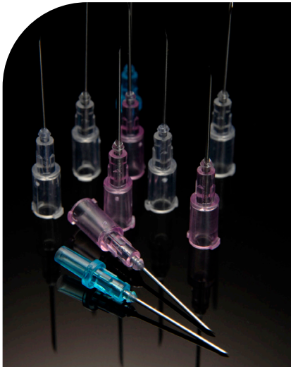
Materials formulated with Ultra-Red technology are colorless when not exposed to UV light.